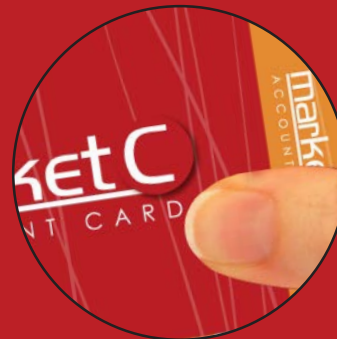
Scan Your Market C Account Card