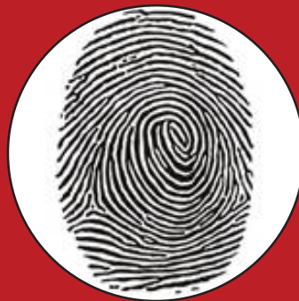
Scan Your Fingerprint

Select Credit to pay with a credit/debit card or Select Account to access your account via the following options: